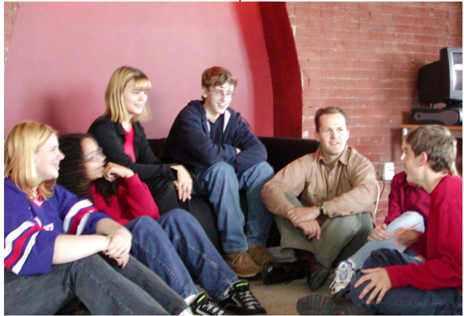
At the Met School in Rhode Island, advisories remain in place throughout a student's high school years.

The move is gaining momentum to break up larger, comprehensive high schools all across America into themed academies. The Bill and Melinda Gates Foundation has set aside tens of millions of dollars toward this cause. There are national and statewide networks that assist schools in setting up academies. The largest such organization is the New York City-based National Academy Foundation with over 1,000 member academies around the country. NAF defines its mission thus, "The mission of the National Academy Foundation (NAF) is to sustain a national network of career academies to support the development of America's youth toward personal and professional success--in high school, in higher education, and throughout their careers." 5 In California, the "Career Academy Support Network is housed within the Graduate School of Education at UC Berkeley. Its purpose is to support the growing number of career academies developing around the country,