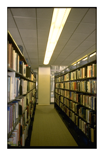
Illustration 4: Stack lighting runs parallel to the stacks at the San Francisco Main Library, and the lighting is very even from top to bottom of each stack.

The parallel scheme uses a single row of one-lamp linear fluorescent fixtures centered above each aisle. The fixtures can be recessed in the ceiling, suspended below the ceiling, or attached to the stacks. Ceilings are often made of acoustic tiles that are installed on a 2'-0" module, but stacks are installed on various spacing from 5'-0" to 6'-0" on-center, so it is often difficult to center recessed lights over the aisles without modifying the ceiling grid. The fixtures must distribute light evenly across the stacks, with adequate light reaching the bottom shelf and no dark areas at the top shelf. Attaching lights to the stacks may be the only solution in high-ceiling rooms where suspended fixtures would be visually obtrusive, but the mounting and wiring details for stack mounting can be expensive. Despite these cautions, the parallel scheme makes intuitive sense and has the potential to have the lowest energy use.