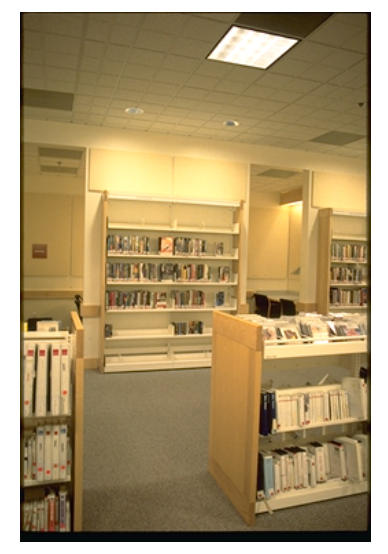
Illustration 11: With additional wall washers, the perimeter bookshelves are lit and the space feels brighter, even though the average lighting level on the tables is the same as in Illustration 10.

Regardless of the lighting level on work surfaces, walls in public areas and staff work areas should not be left completely dark. Continuous " wall washing " is not required, but dark areas on perimeter walls should be minimized where this is consistent with the architectural design. Many types of program elements (bookshelves, bulletin boards, displays, telephones, work counters, etc.) tend to accumulate near walls, and flexibility will be increased if the perimeter is not left dark. In addition, a well-lit perimeter creates spatial definition and gives the entire space a feeling of brightness.