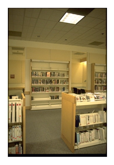
Illustration 10: Although recessed 2'x2' fixtures with parabolic louvers can provide low-glare lighting for reading tables, they do not light the perimeter of the space very well.

Regardless of the lighting level on work surfaces, walls in public areas and staff work areas should not be left completely dark. Continuous " wall washing " is not required, but dark areas on perimeter walls should be minimized where this is consistent with the architectural design. Many types of program elements (bookshelves, bulletin boards, displays, telephones, work counters, etc.) tend to accumulate near walls, and flexibility will be increased if the perimeter is not left dark. In addition, a well-lit perimeter creates spatial definition and gives the entire space a feeling of brightness.