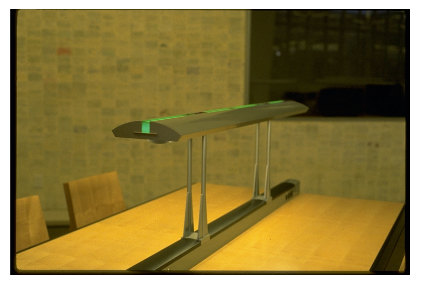
Illustration 9: Table lamps must light the table evenly and be very sturdy. The base of these lamps at the San Francisco Main Library also includes power and data wiring.

Table lamps, where provided, should be of very durable construction and should be designed to spread light evenly across the work surface. In public areas, they should be securely mounted to furniture and should not obstruct the librarian's view across the room.