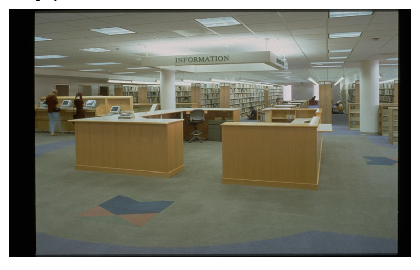
Illustration 8: Recessed fixtures with parabolic louvers provide lowglare lighting at the Sacramento Central Library.

Direct lighting uses down lights to illuminate the reading tables. The down lights can be as small as 6" diameter fixtures with compact fluorescent or metal halide lamps and parabolic cones, or they can be linear or rectangular fluorescent fixtures with parabolic louvers. The parabolic shape of the cones and louvers prevents seeing the lamps at shallow viewing angles and re-directs the light so it is less likely to be reflected in computer screens. The parabolic cones or louvers should be made of aluminum, not plastic, and they should have a "semi-specular" finish to reduce the visibility of dirt or fingerprints.