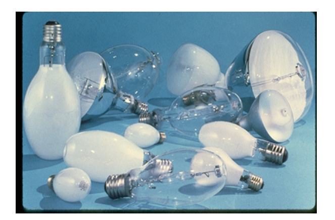
Illustration 3: Typical HID lamps

Although color is still a problem with high-pressure sodium lamps, improved-color metal halide lamps are now available. These lamps, called "ceramic-arc-tube lamps" have very good color that is similar to incandescent light. As these lamps become available in a wider range of sizes and wattages, they will become increasingly common in library interiors.