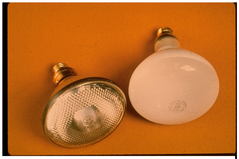
Illustration 2: Incandescent PAR-lamps (left) and R-lamps (right) incorporate reflectors into the basic bulb shape to improve efficiency.

Incandescent lamps produce light by passing an electric current through a filament; when the filament gets hot enough, it radiates visible light. Incandescent lamps are very inefficient and have relatively short lamp life, but they have a familiar warm yellowish color of light that is often associated with non-institutional environments.