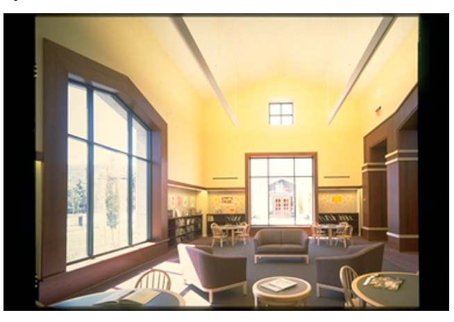
Illustration 7: Indirect lighting softly illuminates some of the reading areas at the Danville Public Library.

Indirect lighting uses fluorescent or metal halide lamps to up light a light color ceiling; the resulting reflected light is inherently very soft, shadow-free, and low-glare. Indirect lighting works well for both paper-based and computer tasks in rooms where the ceiling height is at least 9'-6" and preferably more than 10'-0".