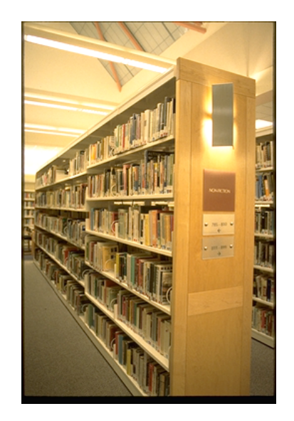
Illustration 6: Direct-indirect lighting runs perpendicular to the stacks at the Albany Public Library, and the lighting is very even across the entire stack face.

Outward-facing periodical shelves are especially difficult to light because the clear plastic protective folders on the magazines reflect any overhead lighting, which obscures the covers. No scheme is perfect, so it may be best to simply use whichever lighting scheme is used for adjacent standard shelving and live with the compromise. Building lights into the bottoms of the shelves is very expensive and is usually ineffective.