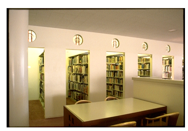
Illustration 5: Indirect lighting concealed on top of the stacks is used in a small library at University High School in San Francisco.

The indirect scheme uses up lights on top of the stacks or suspended from the ceiling. All of the light is reflected off the ceiling, so the illumination on the stacks is very soft, and the entire range of stacks appears to have a pleasant glow. If the ceiling is white and enough light reaches the bottom shelf, this scheme can work well. The energy use can be higher than either the parallel or perpendicular schemes, which could make it difficult to comply with the California energy regulations.