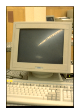
Illustration 12: Lights at service desks should be positioned so they do not reflect in computer monitors.

The lighting level should be 40 - 50 foot-candles (ft-c) on the desk. This can be achieved through a general lighting scheme or by providing approx. 30 ft-c of general illumination and additional task lighting at the portions of the desk where paper-based tasks are performed. The lighting should be located so it does not cause glare on computer screens. This is very difficult to do if the screens are recessed into the desktop. If down lights are located above the desk, they should have lenses or diffusers to soften the light that occurs directly over the librarian's or patron's head.